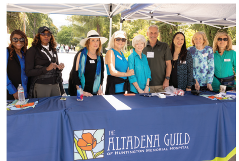
Altadena Guild welcomes attendees