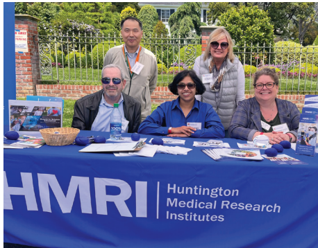
HMRI leaders attend Home and Garden Tour

In February 1952, the Altadena Guild held its first home tour, charging $1.50 for admission to three Altadena homes or $2.00 for admission and dessert. The tour yielded $428, which the Guild donated to the medical research facility that would later become HMRI, and inaugurated a 70-year legacy that has raised more than $2.5 million for HMRI.